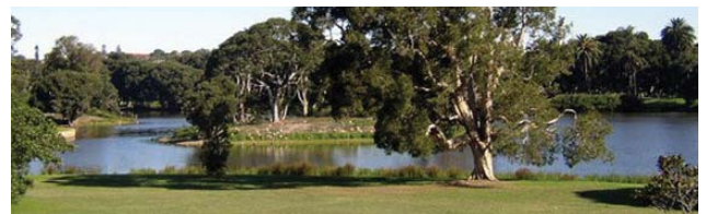
Sydney Park, Olympic Park and Centennial Park all successfully weave natural and reconstructed ecologies with passive recreation.

The proposed extent at the foreshore is reduced by 40% and retains lawn along the existing foreshore wall.