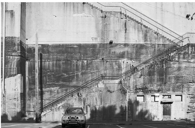
Historic stairs at Millers Point connect neighbourhoods along the cliff escarpment.