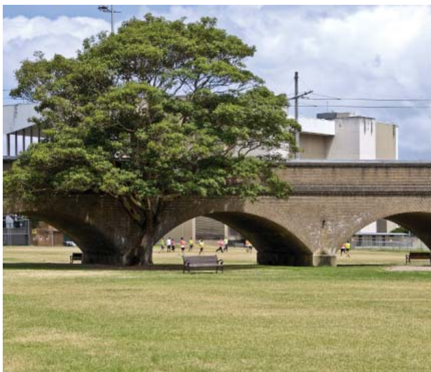
The Village Green at the Crescent will provide open vistas through the viaducts, similar to Wentworth Park and Federal Park.