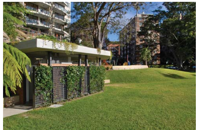
The toilet at Beare Park is well designed with high quality amenities with good passive surveillance and access from the playground.