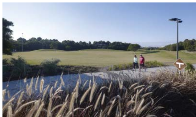
The Village Green at Sydney Park is used for informal ball games as well as other activities including community events.