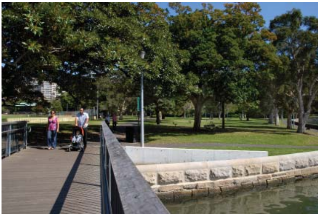
The bridge over the canal at Rushcutters Bay connects the foreshore path and creates a walking circuit with the bridge further along the canal.

Stair access connects the surrounding neighbourhoods with the parkland, and specifically the new open space at Harold Park. Connections to these new open spaces ensure they are perceived as public open space, safe and well used.