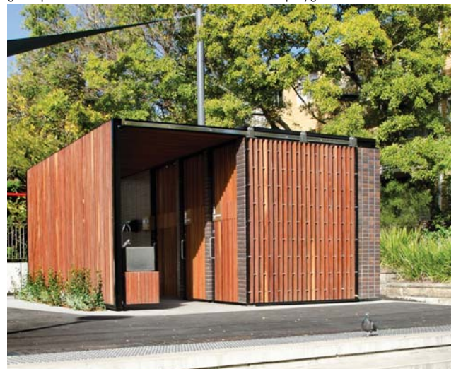
The toilet at Foley Park has good surveillance from the street and park.