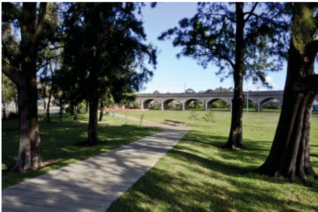
Federal Park is used for both structured sports as well as other activities such as picnicing, dog walking and informal games.

Both sites can host a range of informal active or passive recreation activities when not being used for ball games.