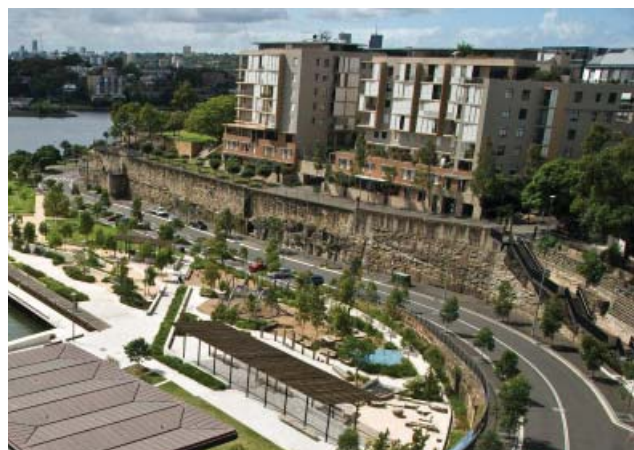
Stairs at Pymont connecting neighbourhoods to Pirrama Park, are sympathetic to the cliff face and surrounds. They provide an opportunity to experience the cliff face and offer a unique perspective of the surrounding area.